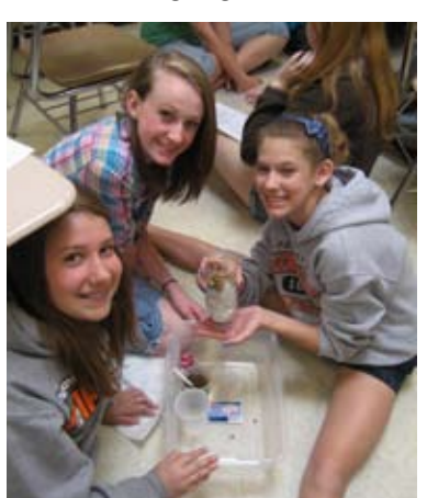
PJHS eighth graders building a water filter.

building water filters, visiting the water treatment plant, developing and narrating digital stories, and tracking their water use. Middle school