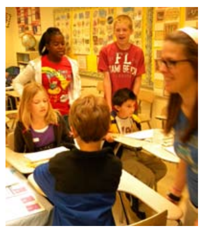
PJHS eighth graders leading a water conservation activity with a group of 3rd graders from Oakdale elementary.

The goal of the grant- students will become experts on critical water related issues including conservation, civilization, consumption and life. Lessons involved students designing websites, reading waterrelated poetry, painting ceiling tiles, competing in Water Olympics,